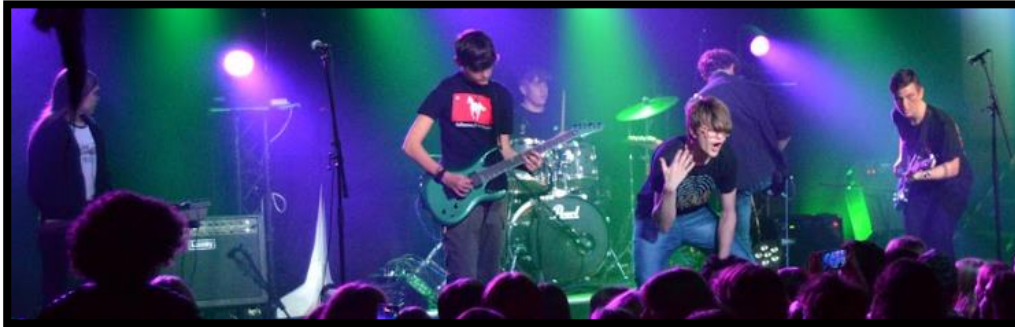
E22 – School Band Performance

Your child will be offered an activity for the week during November 2023 with acceptances due back to school by Friday 8th December 2023 .